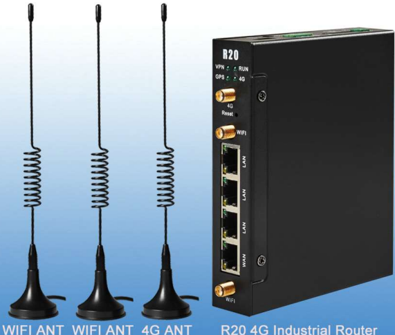
WIFI ANT WIFI ANT 4G ANT R20 4G Industrial Router

Provide High Speed wireless data access internet, supports 4LAN, WIFI, and RS485 or RS232 serial port. suitable for IIOT applications.